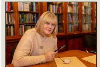
ACTOR Sarah Lancashire has lent her support to a campaign to bring home one of Charlotte Bronte's 'Little Books' - miniature childhood diaries.

"I like to discuss serious issues, but deliver them comically. When people receive serious issues through laughter, it can help them to think about those issues deeper, through the persuasiveness of comedy - we should utilise humour in our communicational dialogue more often."